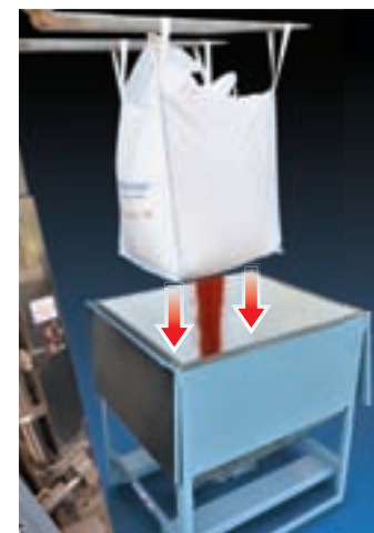
Bins are quick and easy to fill