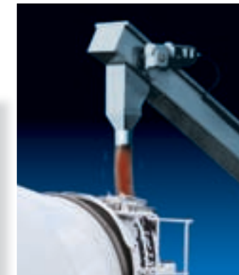
Dispenses pigment directly into a truck